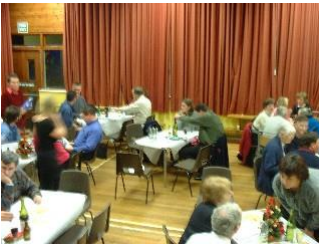
FOBS quiz night in Hall

FOBS was established in 1996 replacing the former P.T.A. (Many parents wanted to maintain links with the school after their children had moved at 11). All parents are automatically members. FOBS plans many events throughout the school year and will keep in regular communication with you. We will be delighted to see you at any of our events, including our planning meetings.