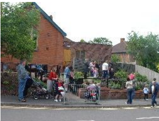
Parents outside Village Hall, waiting for playgroup children

We have positive relationships with local residents, senior citizens, local churches, the police and local businesses.